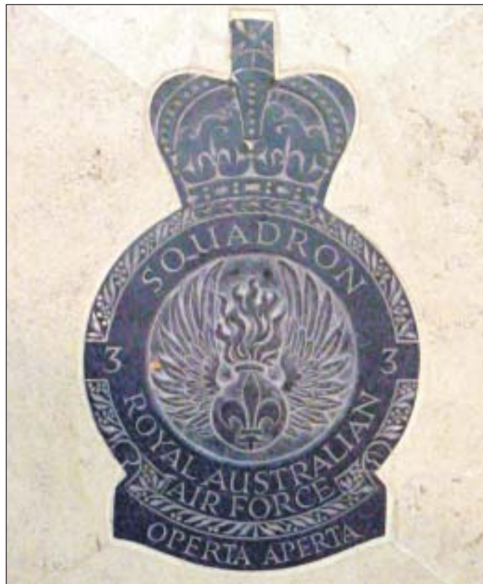
SLATED FOR GLORY: 3SQN's hand-made slate badge, which, along with 10 other RAAF squadron badges, will be laid in the RAF Chapel.

"The response to the planned ceremony has been fantastic, with significantly more people making the journey from Australia than