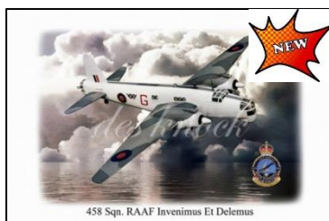
WELLINGTON PRINTS BY ARTIST DES KNOCK