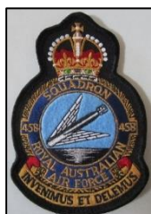
458 SQUADRON BADGE (VELCRO BACKED)

https://www.458raafsquadron.org/memorabilia-shop