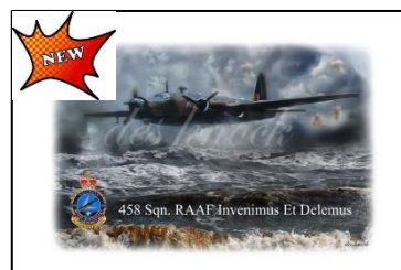
WELLINGTON PRINTS BY ARTIST DES KNOCK