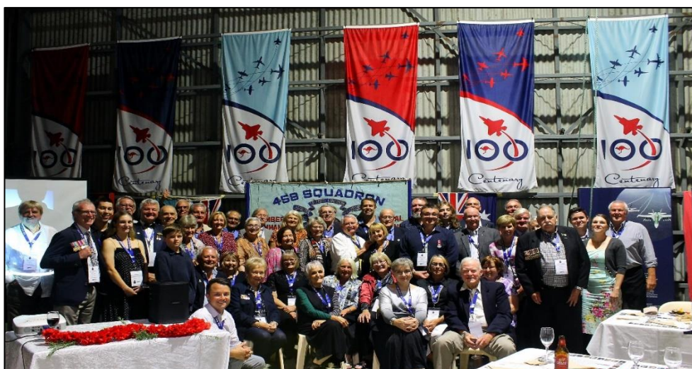
458 Group photo at the 458 Reunion Dinner at Fighterworld, Williamtown, NSW, Saturday 26/03/2022