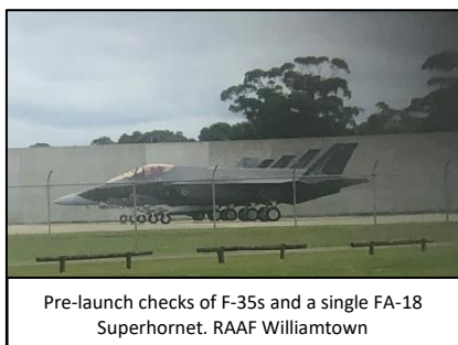
Pre-launch checks of F-35s and a single FA-18 Superhornet. RAAF Williamtown

Our 458 members were then witness to an awesome display of our RAAF front line fighters and support aircraft. This included many take off and landings of the following aircraft. F-35A Lightning II, Hawk 127, F/A-18A/B Hornet, E-7A Wedgetail airborne early warning and control aircraft and more. Members made sad farewells from Fighterworld as they made their way home, concluding a most memorable Reunion.