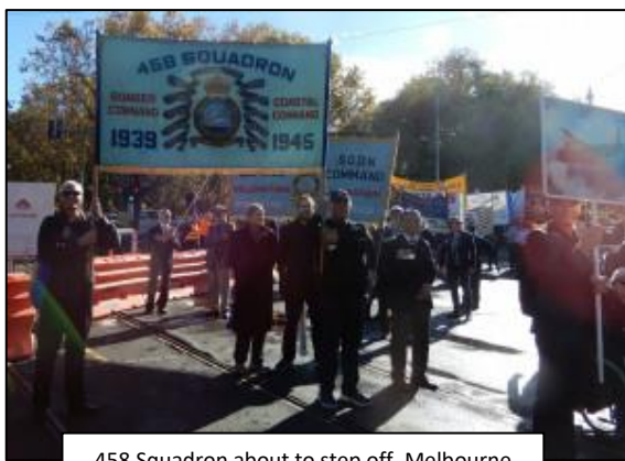
458 Squadron about to step off. Melbourne ANZAC Day 2021