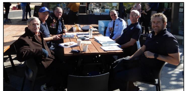
458 Squadron ANZAC Day march participants AGM. Neil Flentje taking the photo. Melbourne ANZAC Day 2021