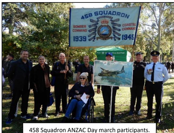
458 Squadron ANZAC Day march participants. Neil Flentje taking the photo. Melbourne ANZAC Day 2021