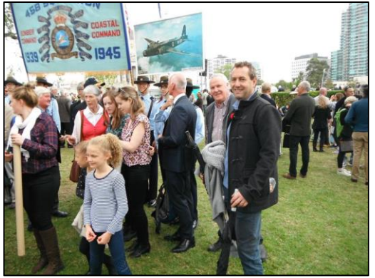
Victoria Flight 2018 ANZAC Day March participants & various photos of the day.