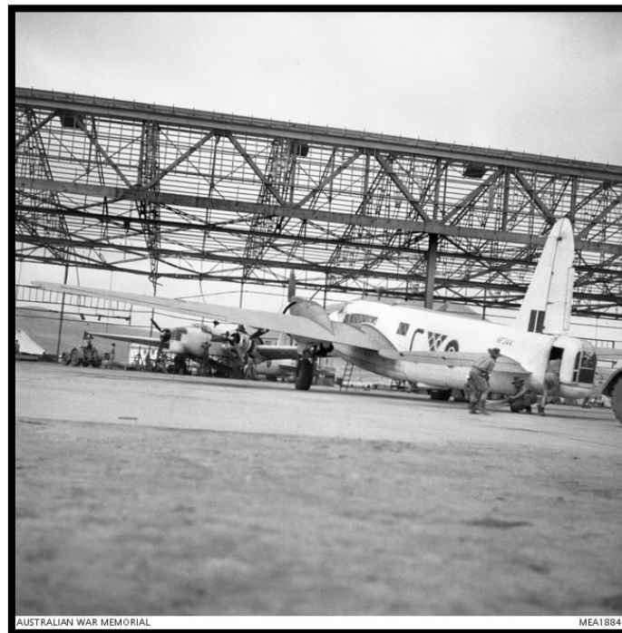
Two Mk. X Vickers Wellingtons at Alghero, Sardinia. Aircraft with serial no. HF344 is in the foreground

Extract of 458 Unit History, page 632, operation on 16-Aug-1944. Note the flight path over the ports of Sète, Toulon and Port-Saint-Louis (-du-Rhone).