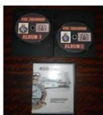
2 photo-DVD set of the Albums

Badge + Postage and Transaction costs to Canada:- 17.00CAD