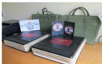
Digitized DVD set sits atop the two Albums

$20.00 AUD when ordering one 2 DVD set (price includes postage anywhere in Australia). Contact Us to order, including notification of total cost if ordering multiple sets (postage will vary) or postage to international destinations. This item will be posted on receipt of payment. Thank you.