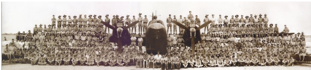
458 Squadron Photo - Protville, Tunisia 1943 - 973 mm x 220 mm.

Order your copies on photographic paper, terrific for framing, when they become available on our 458 Website. Prices TBA