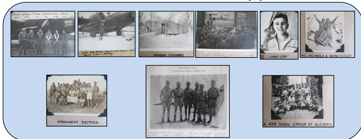
A Random Selection of Photographs from Album 1