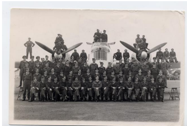
'B' Flight - 785 mm x 300 mm.