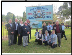
Those of you who receive MUFTI (RSL Vic magazine) see Pg.11.