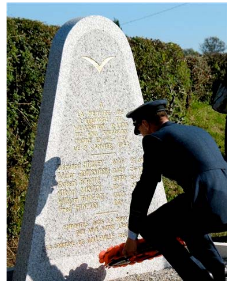
Laying the wreath