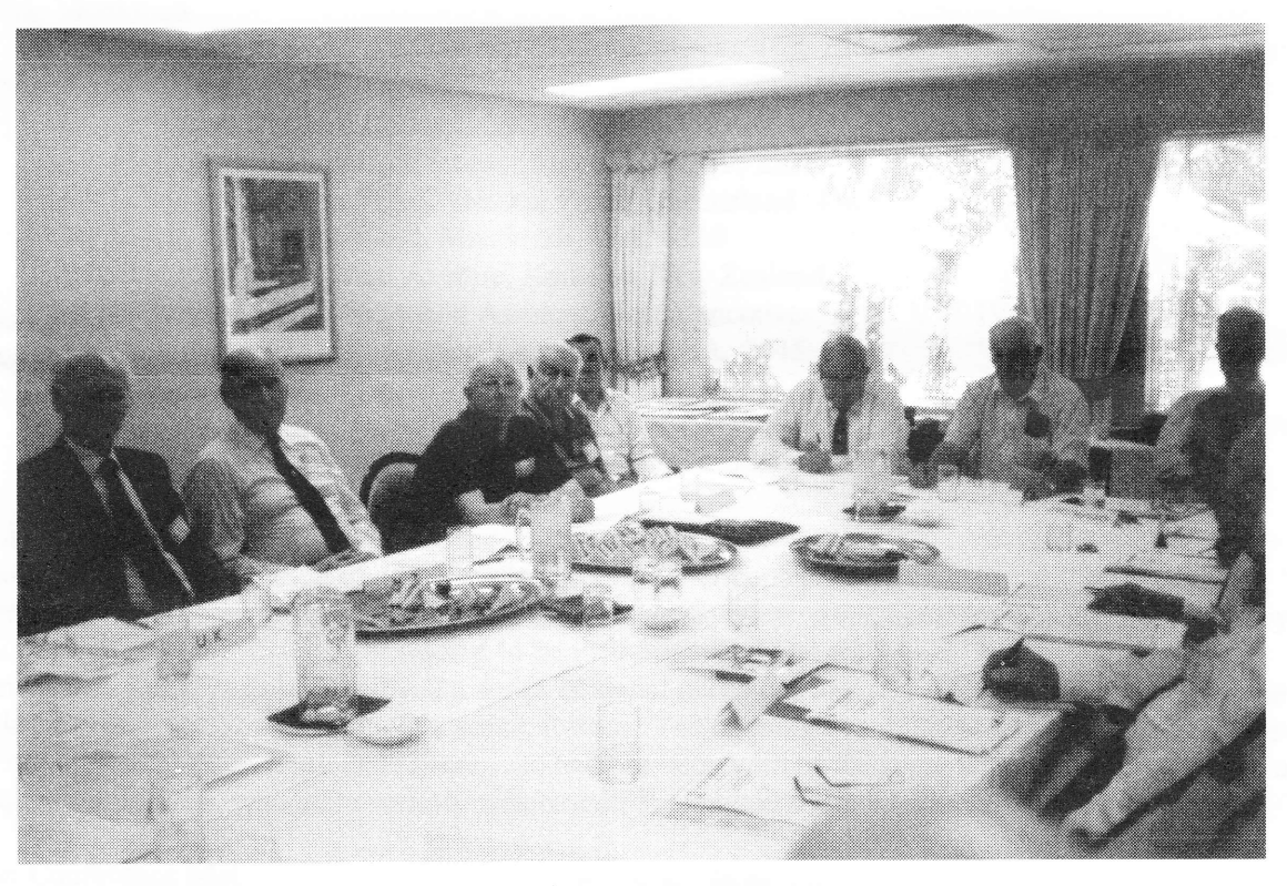
Delegates at the Squadron Conference - Caloundra

Other matters AVADSC and RAAF Association are pushing include – recognition for service people exposed to ionising radiation at Woomera, etc – improved compensation for disabled regulars – treatment, etc, for children and grandchildren of men exposed to radiation – children with a statistically large number of strange disabilities (the USA is ahead of us here). We recently met the Minister of Veterans Affairs (Bruce Scott) to discuss these matters.