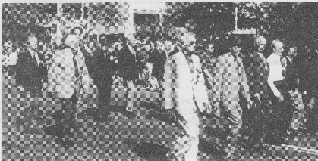
S A Flight one Anzac Day