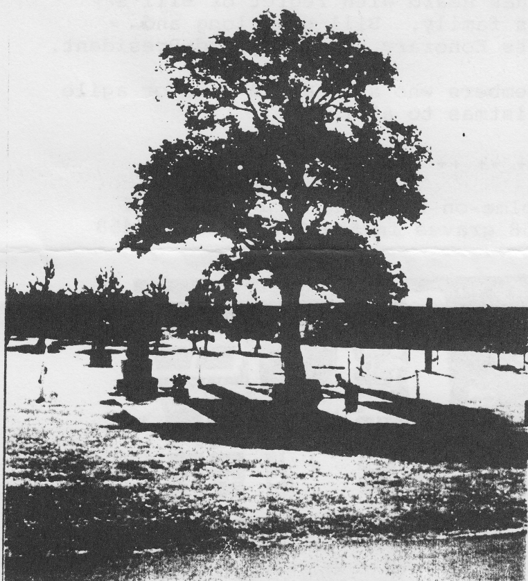
The Tree at HOSM now--compare it with the picture in the Squadron History--p.255 (2nd Ed.)