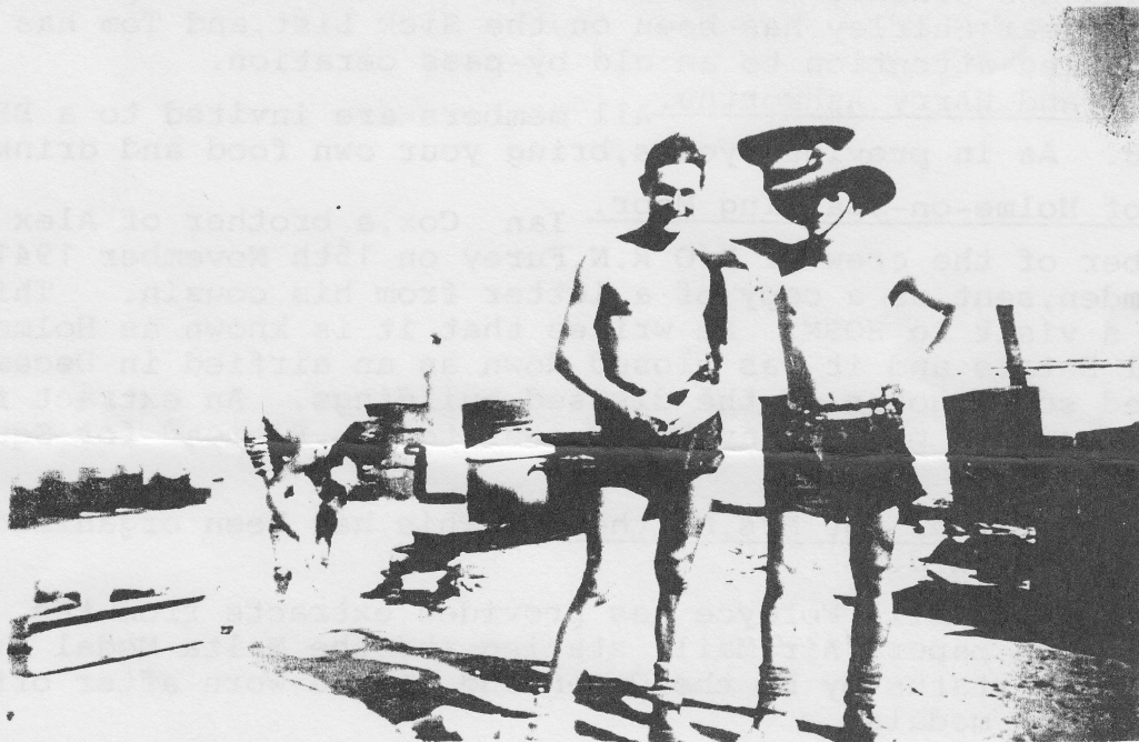
Shallufa, 1943. Cooking in the Egyptian summer---and desert.

We are indebted to U.K. Flight members for recently received Squadron photos--particularly mentioning David Duff. The photos are a varied lot from different times, places and climates.