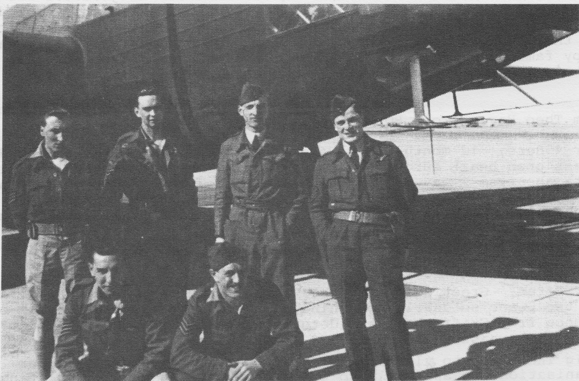
THE SUDDABY CREW.