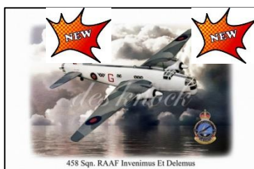
WELLINGTON PRINTS BY ARTIST DES KNOCK