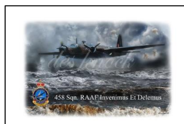
WELLINGTON PRINTS BY ARTIST DES KNOCK